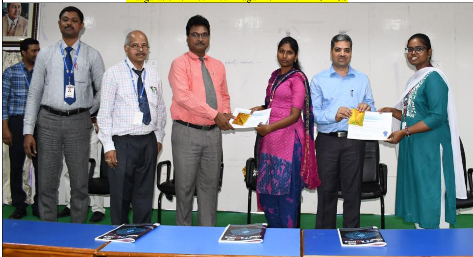
Dignitaries on Dias distributing prizes for winning I Prize in Paper Presentation on eve of 69 th IETE Foundation Day