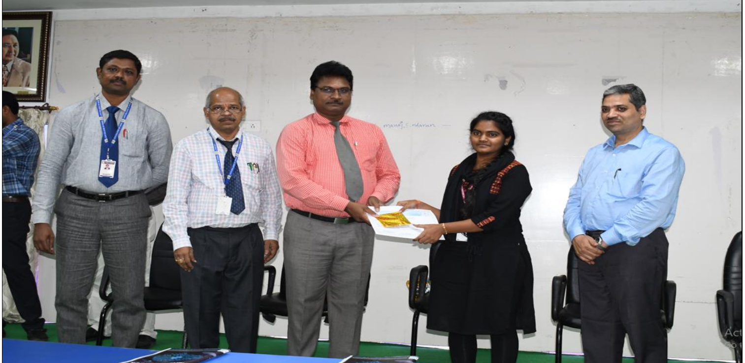
Dignitaries on Dias distributing prizes for winning III Prize in Paper Presentation on eve of 69 th IETE Foundation Day