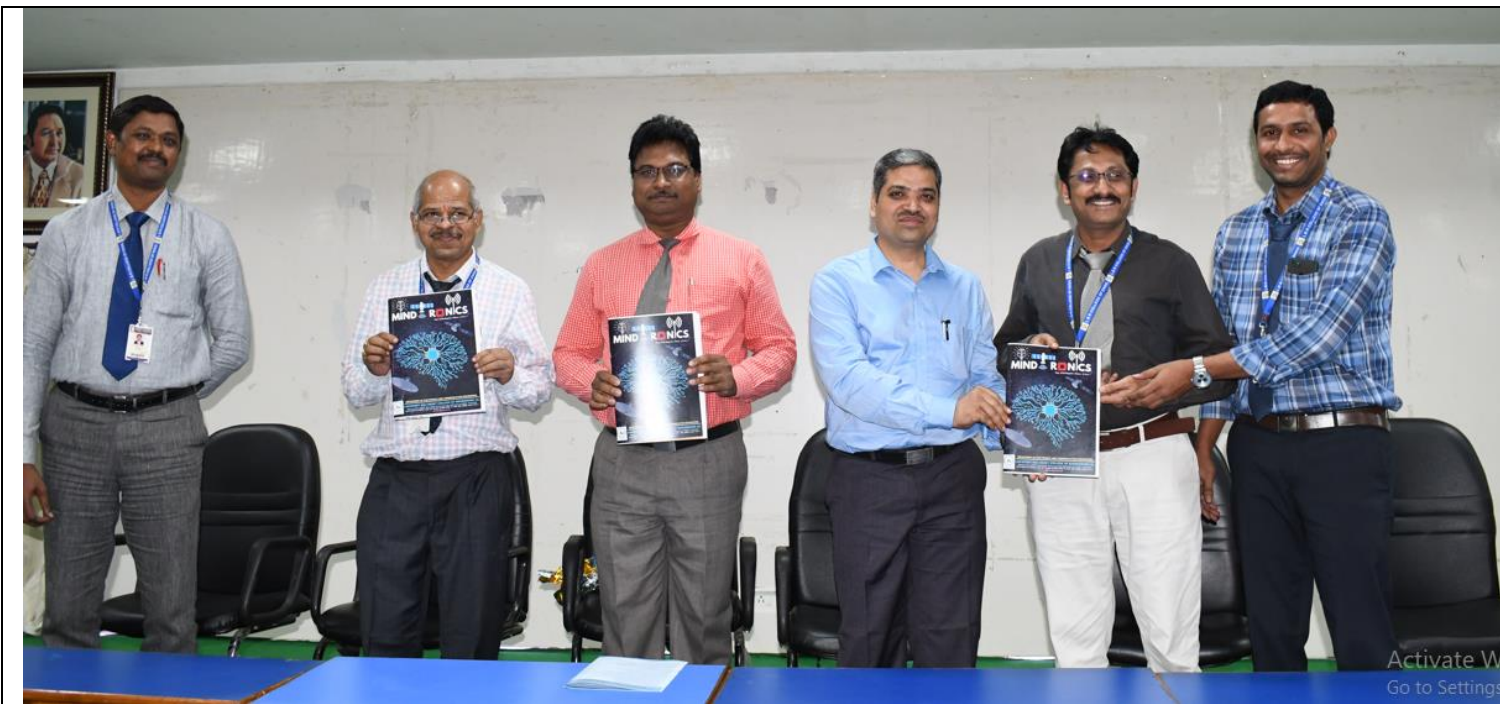
Inauguration of Technical Magazine MINDTRONICS