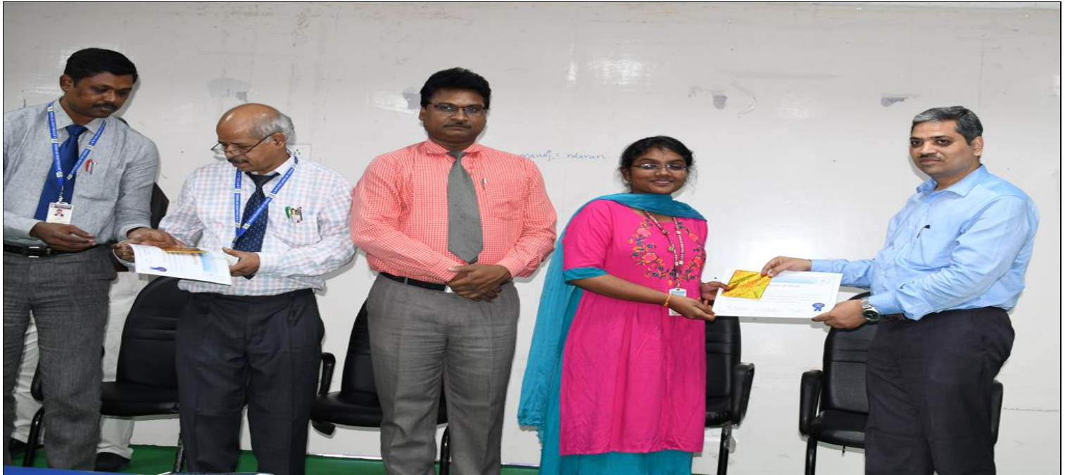
Dignitaries on Dias distributing prizes for winning II Prize in Paper Presentation on eve of 69 th IETE Foundation Day